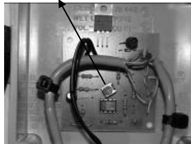
Audio Sensitivity Control the sensi-